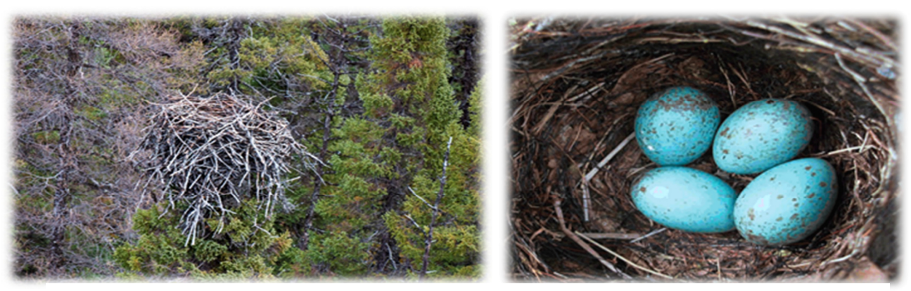
Birds and nests within the project's footprint, such as those seen above, are protected from construction activity on the Muskrat Falls Project through established buffers in active construction zones.