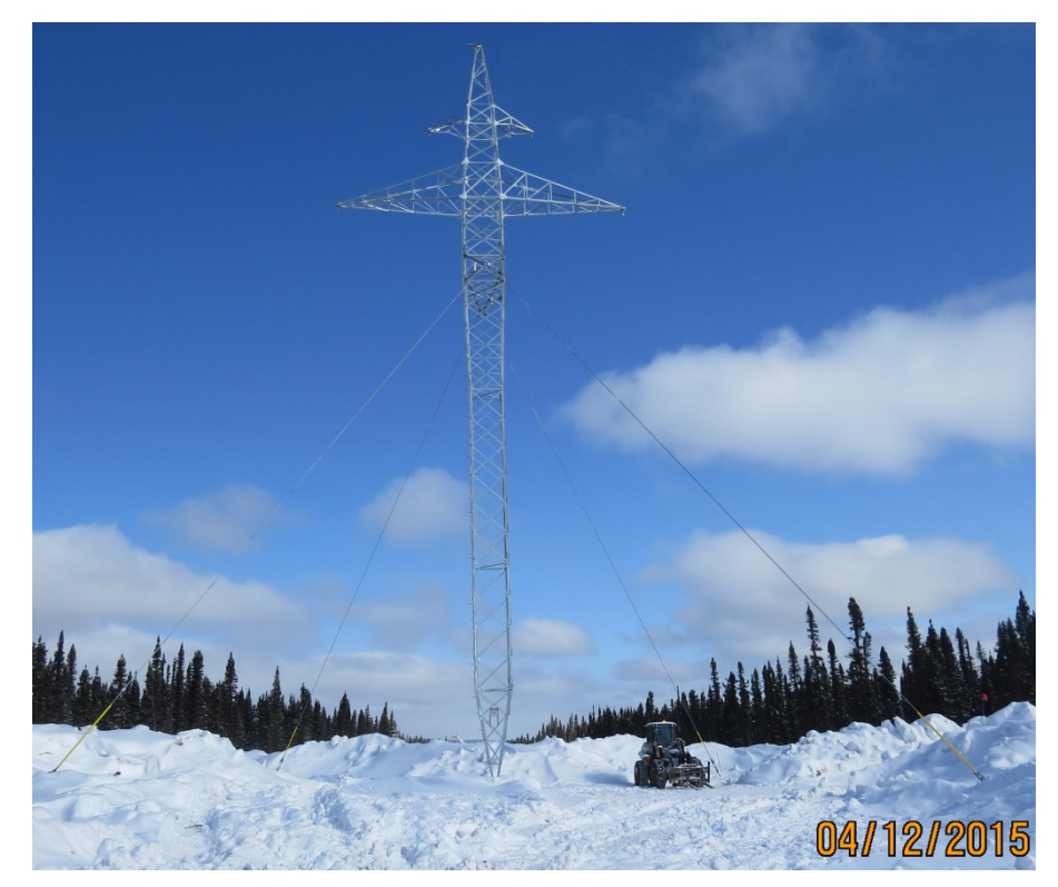
First HVdc tower erected on the Labrador-Island Transmission Link